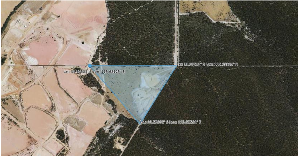
Figure 2 Zoomed extent of area for removal shown with coordinates