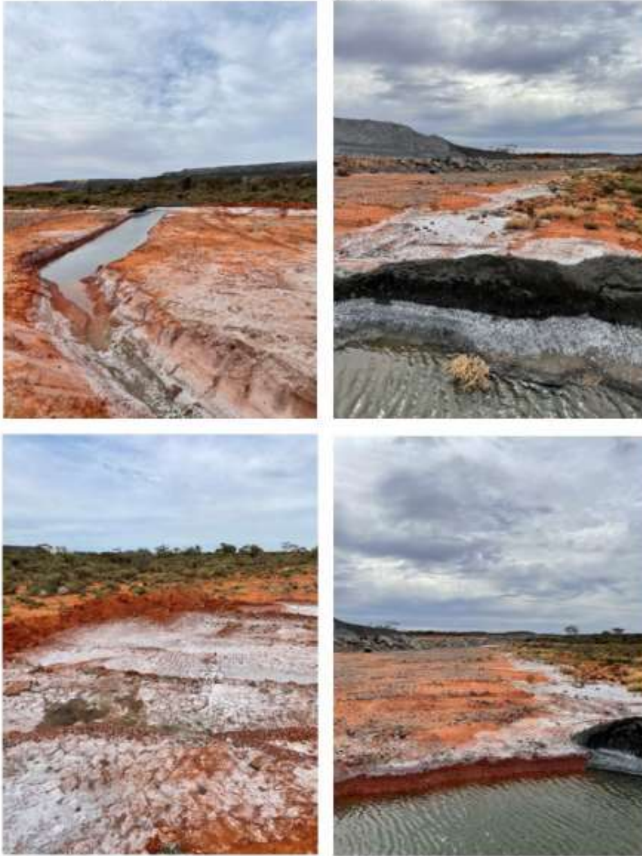
Figure 1-2: Photos of Tailings Spill taken 11/10/21