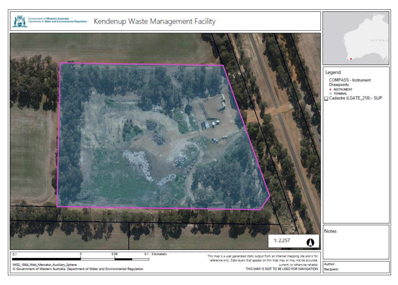
Figure 1: Map of the boundary of the prescribed premises

The boundary of the prescribed premises is shown in pink in the map below (Figure 1).