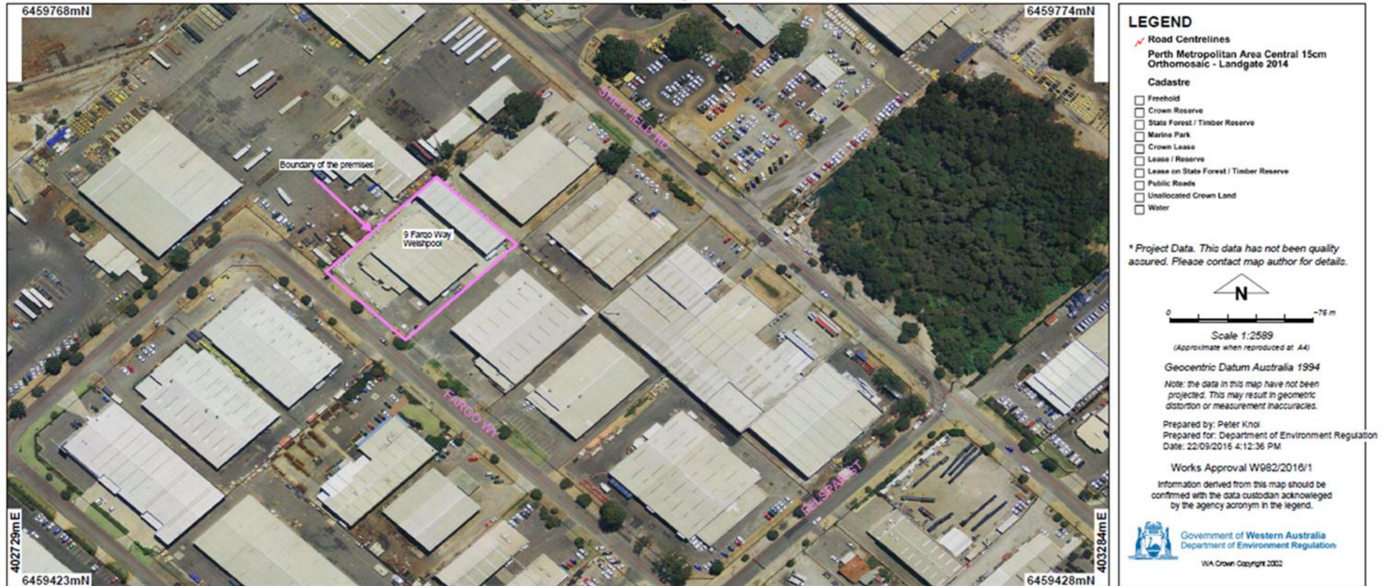
Figure 1: Map of the boundary of the prescribed premises